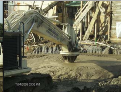
Figure 7. In Situ Mixing