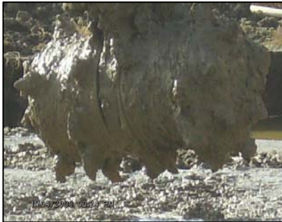
Figure 5. Dual Axis Head