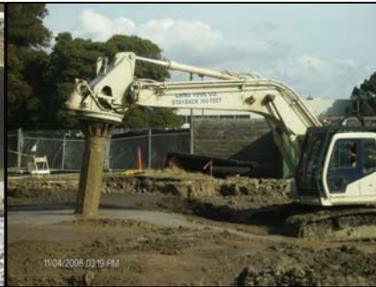
Figure 6. In Situ Mixing